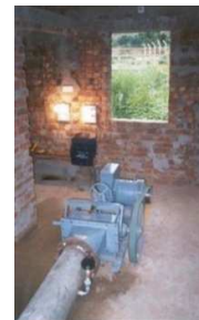
Fig. 4. Bamerchara micro-hydropower unit.

Consequently full power generation was not possible. Furthermore, about 41 percent potential energy was lost by the penstock, turbine, and generator and transmission line. Fig. 5 illustrates relationship between water head and extractable hydropower from a stream.